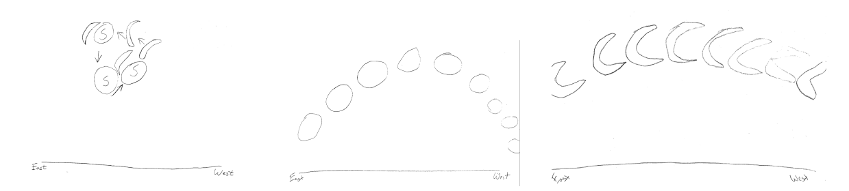
Figure 2. One student's drawings of lunar surface features: pre-instruction (Moon appears to move), post-instruction (Moon rises/sets East to West), and delayed-post (Moon rises/sets East to West).

Table 2. Students' drawings of the apparent motion of the Moon